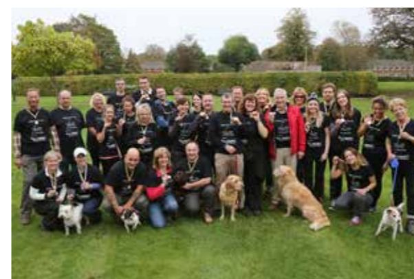
Over 100 walkers joined Oracle in 2014's walk, raising over £7,000