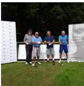
"Dawsons Dynamos" at the 1st tee