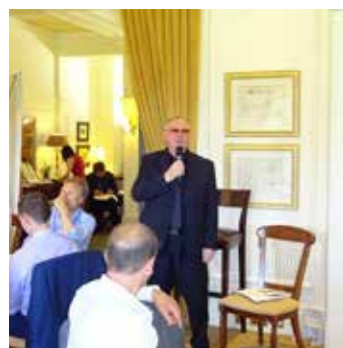
Dennis Taylor entertains