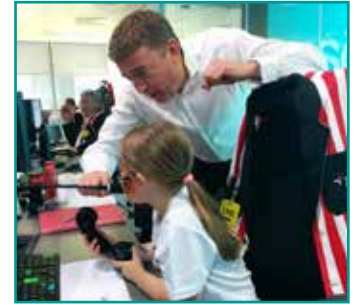
Scarlett gets in on the action with a trade on the busy floor