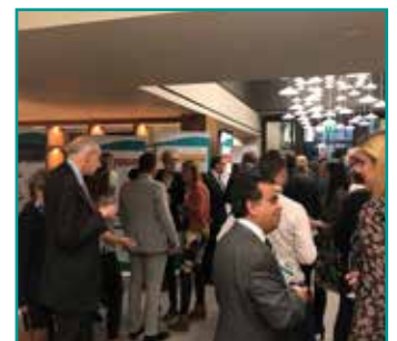
Guests mingle in the busy exhibition area speaking to the researchers

Just 24 hours earlier, the venue was a frenzy of activity with workmen making the final touches to Tony's new five star all-suite hotel set in the heart of the City of London. Oracle were honoured to be the very first guests at the venue and guests enjoyed a champagne reception, a wonderful buffet as well as tours of the property for those keen to see the stunning development overlooking The Tower of London.