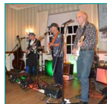
Blues Band "The Hillmans" at work