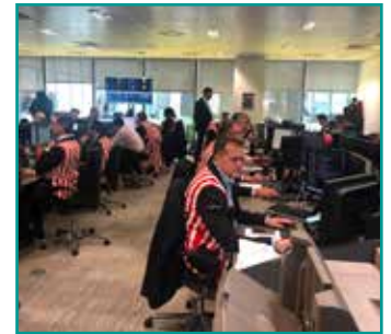
Traders don their colourful charity day waistcoats for the annual fundraiser