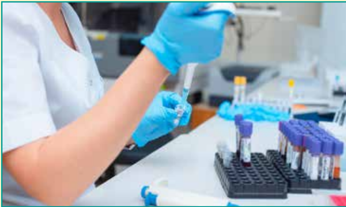
Oracle's laboratory-based research has been paused for now and is due to resume in early June

Oracle Cancer Trust is just one of the hundreds of small charities that provide life-saving pioneering research to bring newer and kinder treatments for patients. AMRC (Association of Medical Research Charities) estimates that 148,000 patients currently on clinical trials have been affected - and for some of these patients these treatments are their only option.