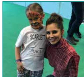
Scarlett with pop queen Cheryl Cole