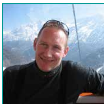
In happier days enjoying one of our favourite pastimes, skiing in the Alps